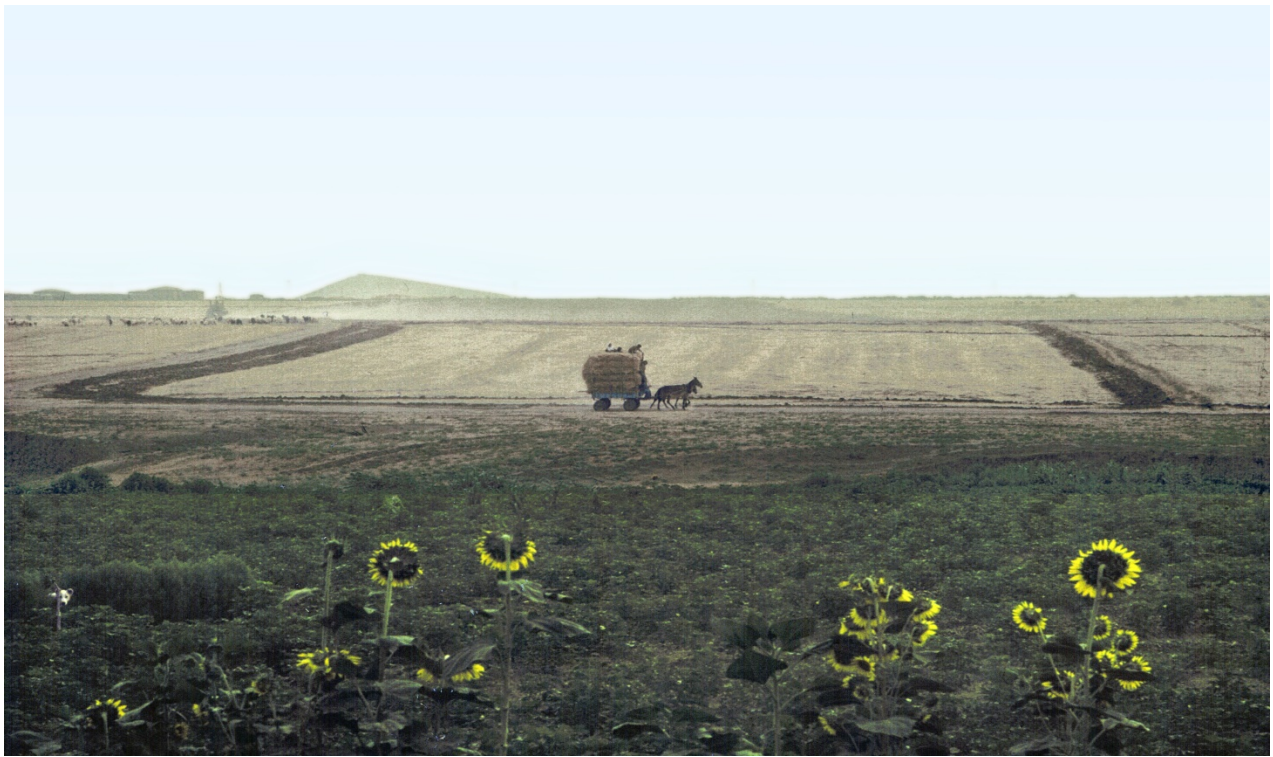
Northeast Syria, dry-farming harvest transport, view East from Tell 'Aid (H. Weiss, July 1981).

The workshop is being structured as (1) pre-workshop reading of invitees’ suggested articles, (2) two or three workshop presentations each morning and afternoon, (3) each followed by Yale faculty participants’ analysis and discussion, (4) with a concluding summary discussion of outstanding issues and research problems.